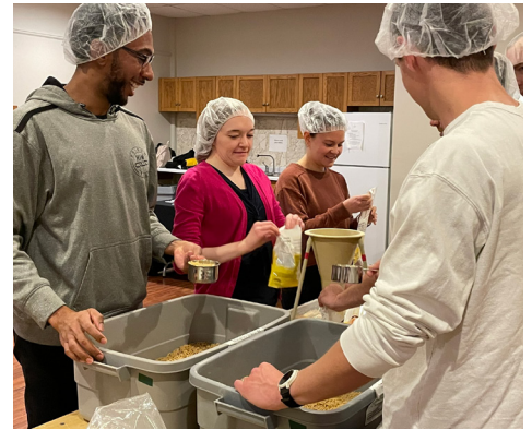
Food packaging with Grace Community Church, Iowa City