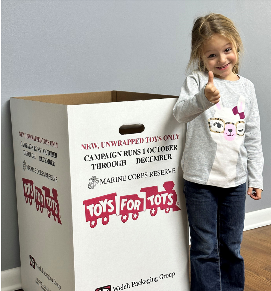
Toys for Tots.

We are excited to announce that our Kalamazoo office is a drop-off location for Toys for Tots again this year. Please bring in your donations during office hours from Oct. 15 through mid-December. Toys for Tots only accepts new, unwrapped toys.